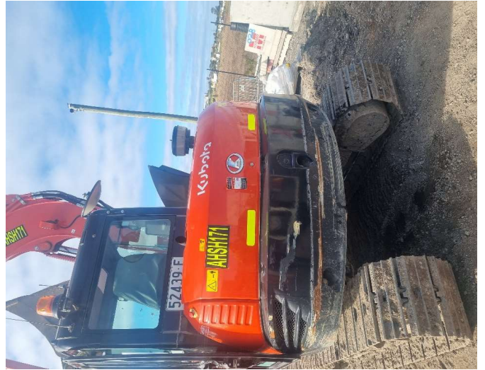
Tyre Condition 1